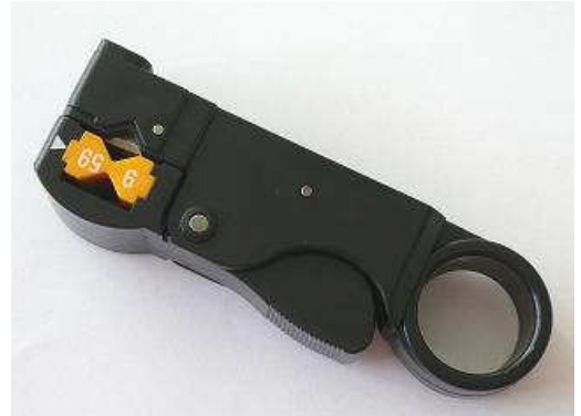
PAT. TAIWAN USA