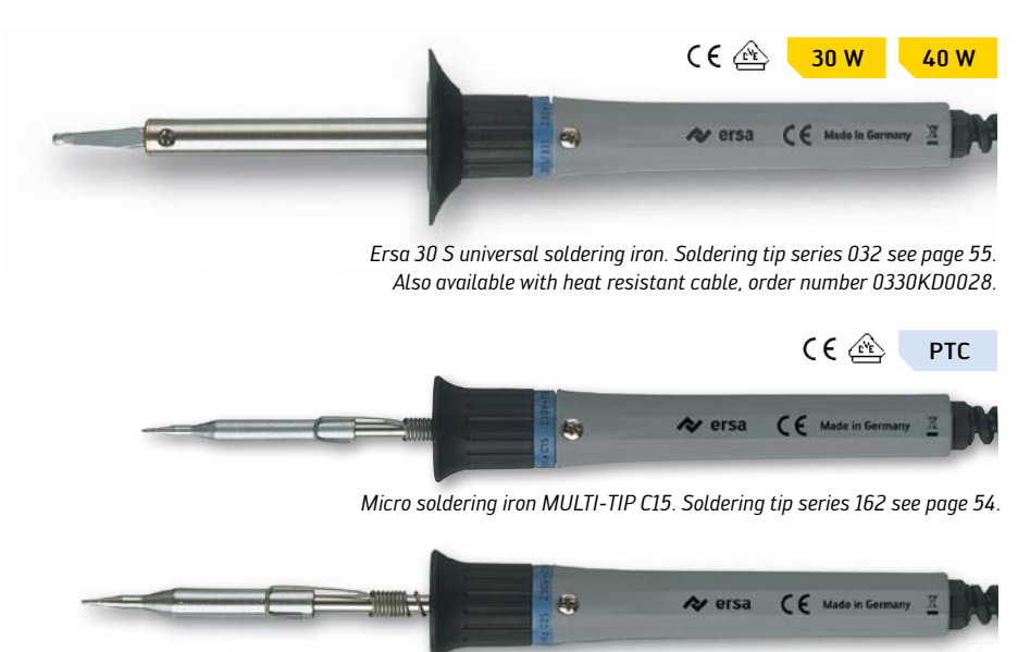
Micro soldering iron MULTI-TIP C25. Soldering tip series 172 see page 54.

The MULTI-TIP irons cover a wide range of applications and stand out by low weight and compact design. The handle stays relatively cool while soldering. The MULTI-TIP is available with 15 W and 25 W and suitable for micro-soldering joints and mediumsized soldering. Internally heated soldering tips and long-life PTC heating elements provide high efficiency and a constant tip temperature.