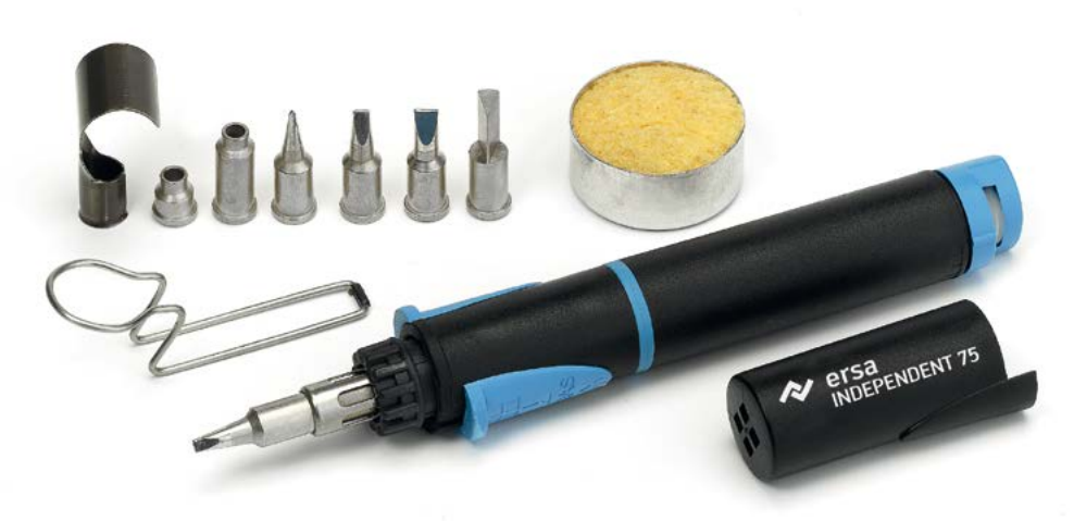
Soldering tip series G072 see page 51.